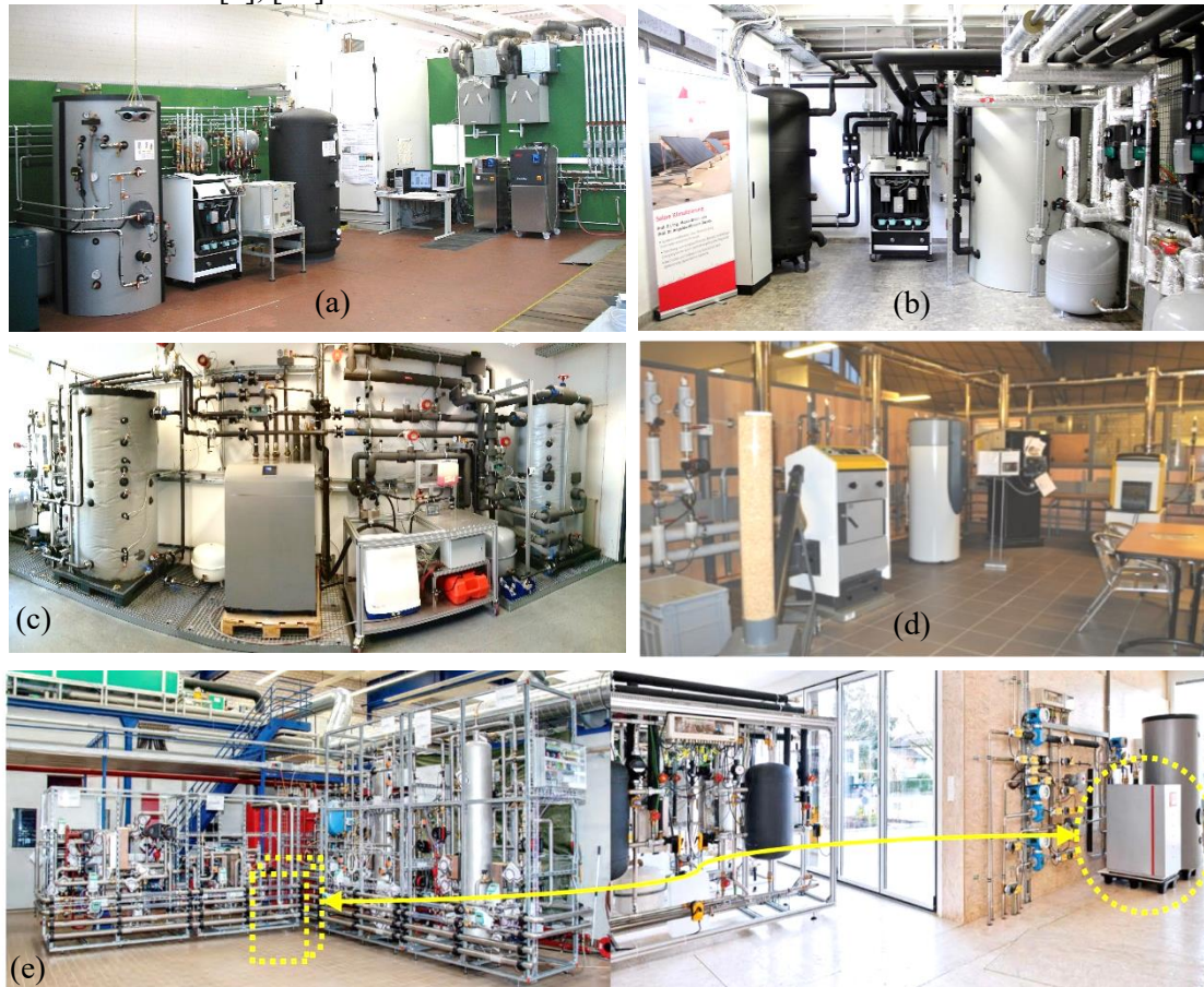
Figure 1 (a) Polygeneration lab in Offenburg University of Applied Sciences (HSO), (b) Solar cooling lab in Karlsruhe University of Applied Sciences (HKA), (c) Trigeneration lab in Koblenz University of Applied Sciences (HSKo), (d) Micro-cogeneration lab in National Institute of Applied Sciences Strasbourg (INSA), (e) Building technologies lab at University of Applied Sciences and Arts Northwestern Switzerland (FHNW)

laboratories and examples of the building automation and control framework can be found in previous works of the authors [9], [10].