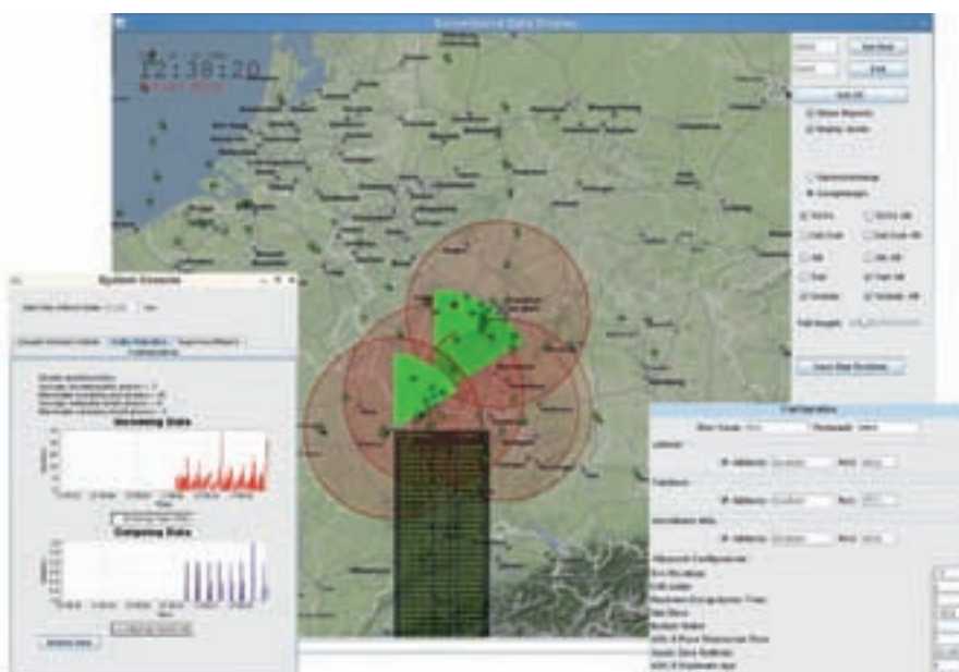
Fig. 1.10-3: shows an excerpt of the TIS-B servers operational console